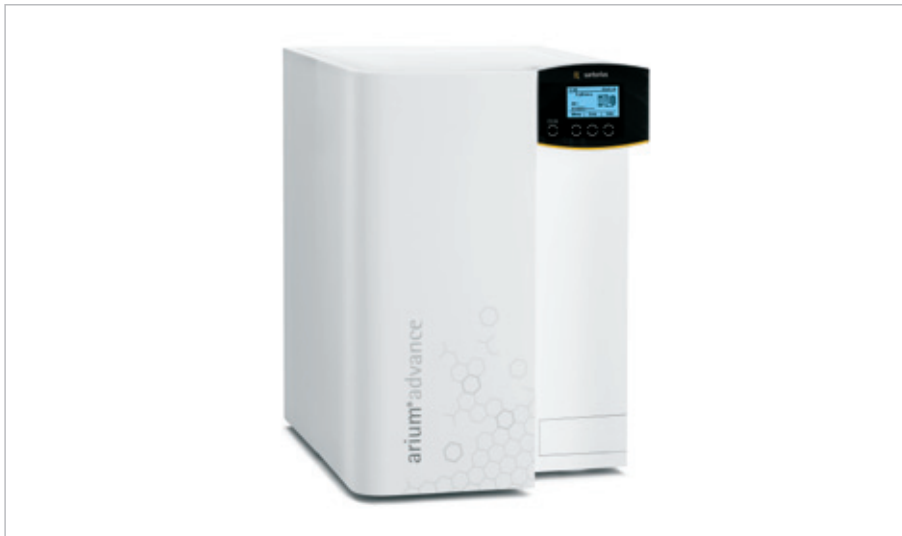
Reverse osmosis system for water purification

Optimized water consumption – automatic with iJust