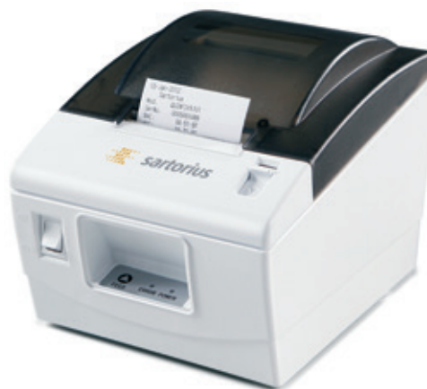
Plug & Play Standard printer YDP40

Two large, easy-to-adjust feet and an outstandingly simple-to-read level indicator on the front make it a breeze for you to level the Practum®. This helps ensure accurate, repeatable weighing results.